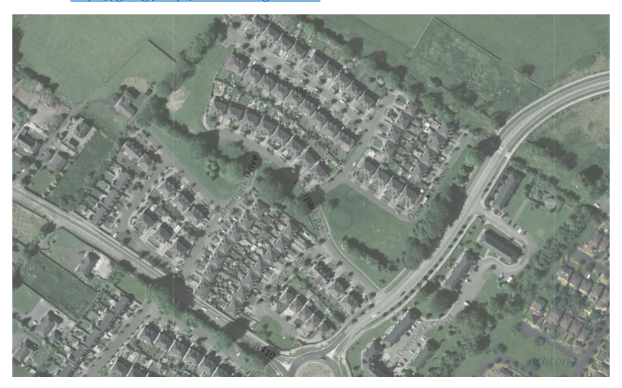
Recent satellite image of Deerpark Estate

Location: https://goo.gl/maps/6eLuBHeE3gArRna67