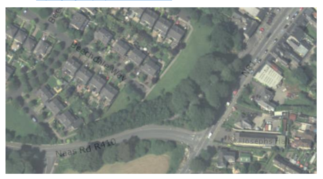
Recent satellite image of Dempsey's Lane

Location: <a href="https://goo.gl/maps/rpToWCD4N5PeCSa49">https://goo.gl/maps/rpToWCD4N5PeCSa49</a>