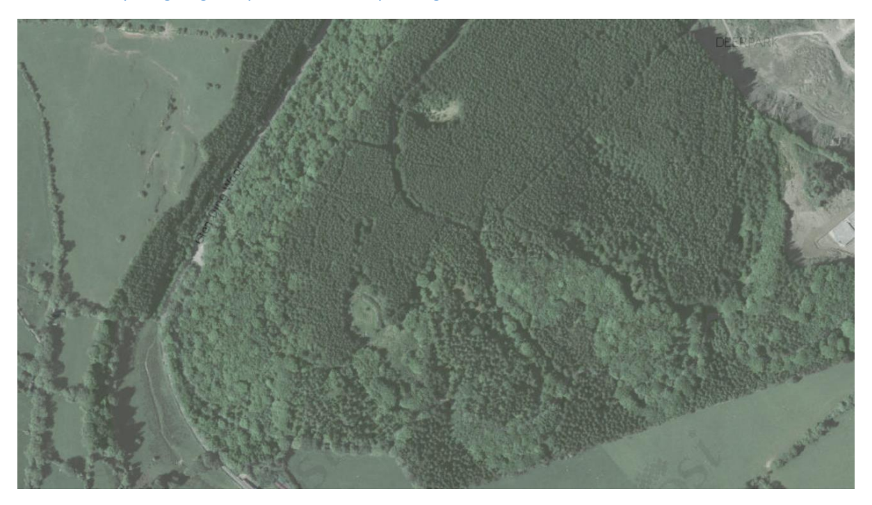
Recent satellite image of Glending Forest, available on OSI.ie

Location: https://goo.gl/maps/3c3PVnGaUqeNUUgL9